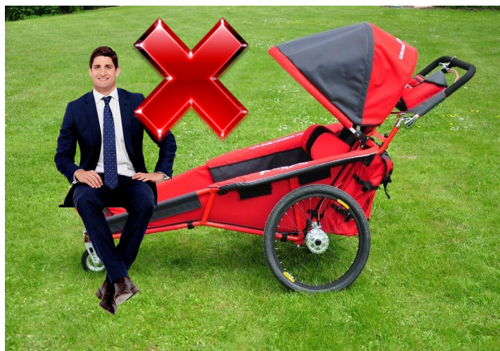
Set up of xRoveru as a stroller – included small front swivel wheel 6".

It's strictly prohibited/forbidden by manufacturer Volter s.r.o. to step on, sit on or to put any heavy objects or things on the front top end of all buggies xRover. This means in any type/version of adjustment of xRover for driving and servicing. xRover buggy in any size is strictly intended for the carriage of only one person up to height and weight declared to each size and size of the xRover. More to see in Technical specifications in Users Manual. Damages caused by overloading the buggy in these parts can not be admitted as a complaints.