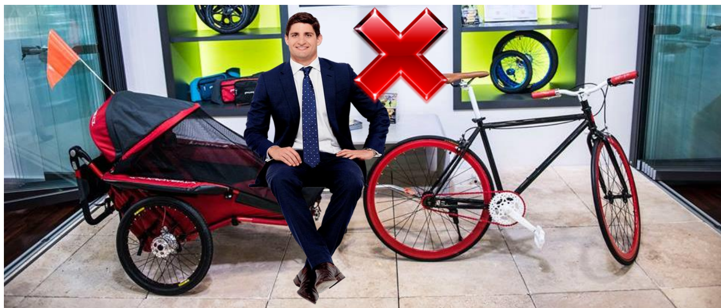
Set up of xRover as a bike trailer – connected with cycloset with a bike