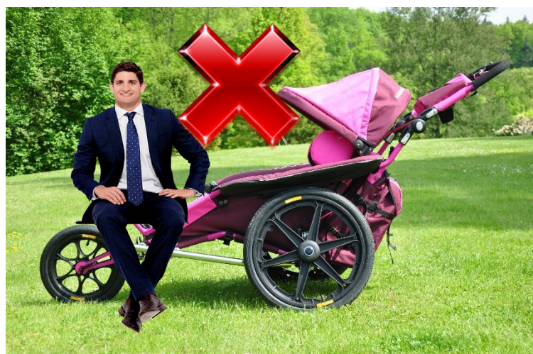
Set up of xRover as a jogger – included front hard fastend wheel 14".